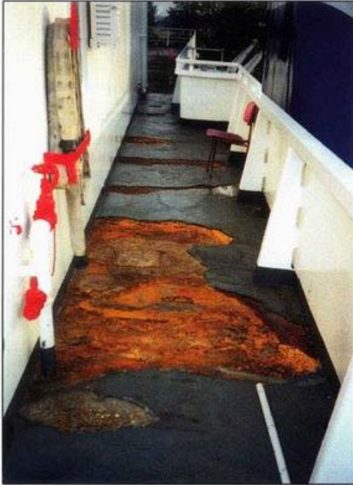
Failure of rigid decking products that were used to slope and coat a flexible ship deck. This deck cracked from the ship's movement, allowing the water to penetrate to the metal, resulting in rust.