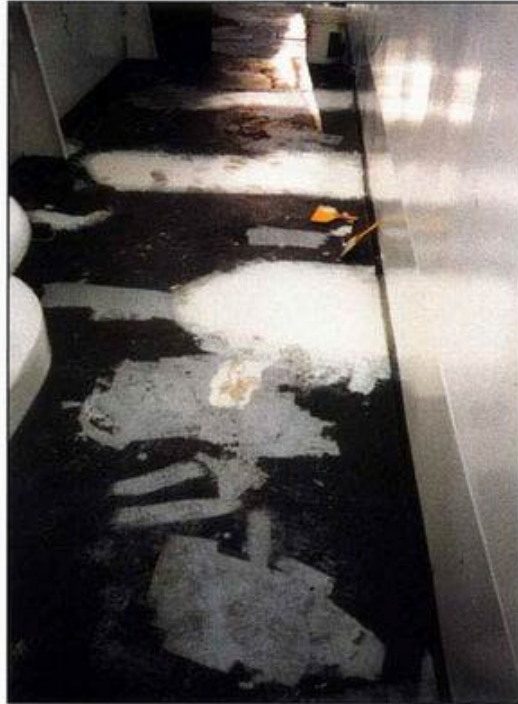
The failed sections of this rigid product were removed. The deck was cleaned and primed, and the holes were filled and re-sloped with flexible TUFFLEX Sand Slurry .