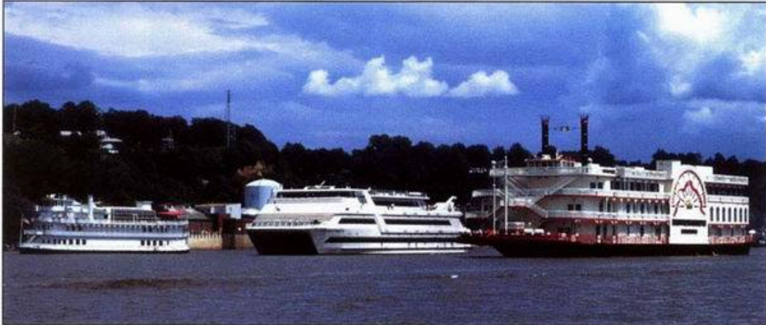
ARGOSY I - Built on site in Alton, IL • ARGOSY II - Atlantic Marine, FL • ARGOSY III - Alabama Shipyard Mobile, AL

Unique, Fast-Curing, Protective and Decorative Resilient Waterproofing Systems