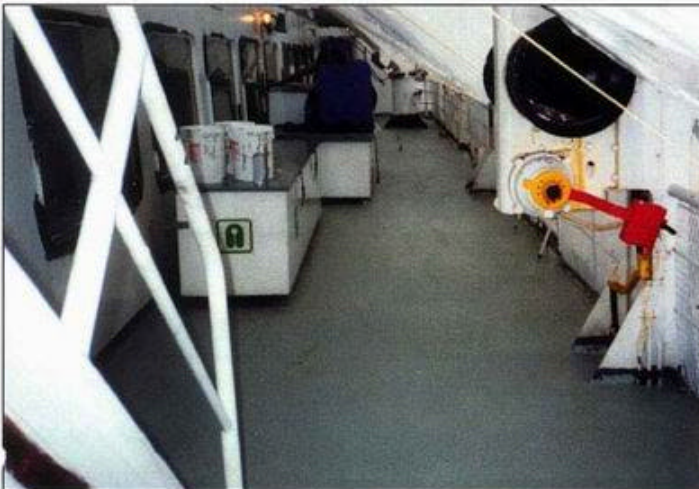
The deck was then coated with a seamless TUFFLEX Membrane System . This customer's choice of texture and colorcoat was then applied for a flexible deck that will now "rock & roll" with the ship's movement. Imagine how much easier and less expensive it would have been to use the flexible TUFFLEX Sand Slurry and Membrane System in the first place!